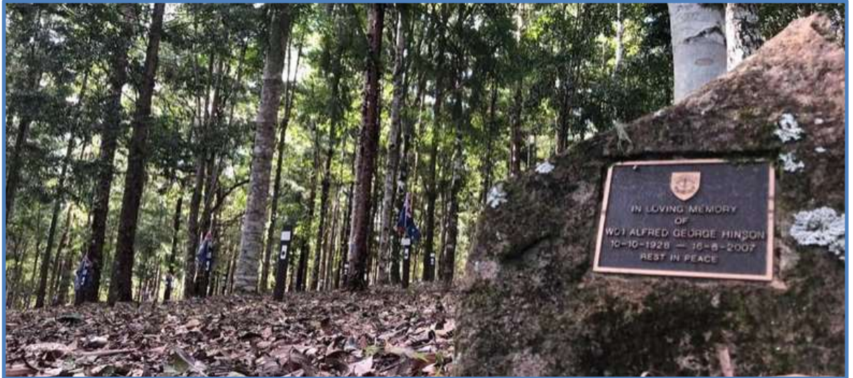
Photo 5-4.8 - The AATTV living memorial 'The Grove' at Canungra.

The AATTV Memorial is located at Kokoda Barracks, Canungra, Queensland. The memorial honours all members that served with the team, with a tree and plaque for each team member – over 1000 trees. An Australian flag has been placed with each tree where the member was KIA or has since passed away.