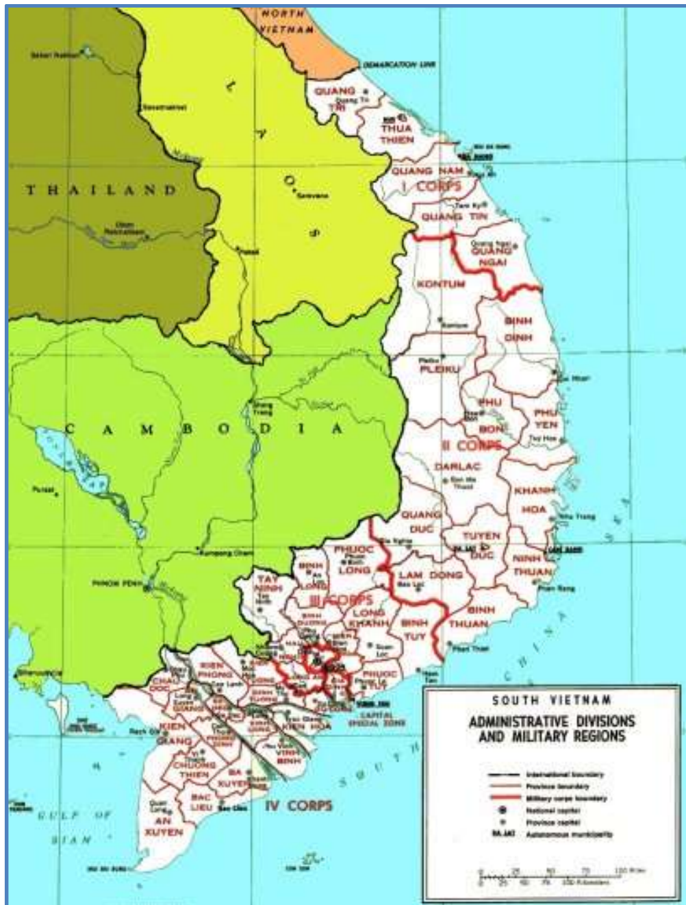
Map 5-4 - South Vietnam with Military Corps 1962 to 1972.

(Mike) Forces, and other local units. Attached to units or battalions as trainers, advisers, and occasionally leaders. Team members usually worked in the field, accompanying units on operations. They worked with various groups from the United States, such as the US Special Forces (USSF) and the US Central Intelligence Agency (USCIA), and under the auspices of the already well-established US Army Advisory system, throughout South Vietnam.