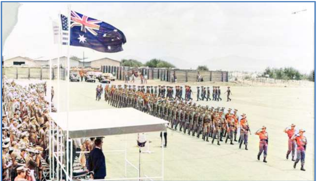
Photo 5-4.2 - AATTV members marching at the parade for the awarding of US Army Meritorious Unit Commendation at Vung Tau 30 Sept 1970.

Members of the AATTV were rarely together as a single unit, apart from on ceremonial occasions, such as ANZAC Day and the presentation of the US Army Meritorious Unit Commendation by General Abrams (Commander MACV) at Vung Tau on 30 September 1970.