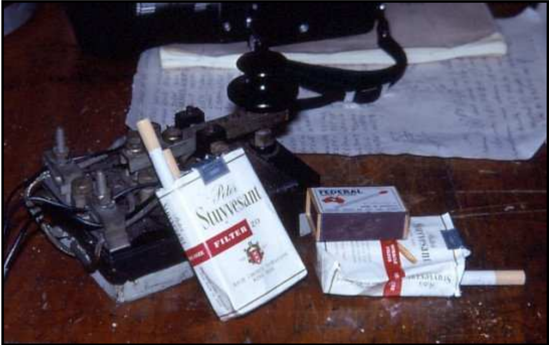
Photo 5-3.4 – LSM Sigs Desk with morse key, smokes and part message decode.

Signal members who served with the 32 Small Ship Squadron all became experienced ship Radio Operators that adapted to ships life, working both with the RAN and Army units in Vietnamese waters, without much support from RASigs. Many would go on to serve in other RASigs roles in the Vietnam War but would always see their service with 32 Small Ship Squadron, as a highlight in their war service.