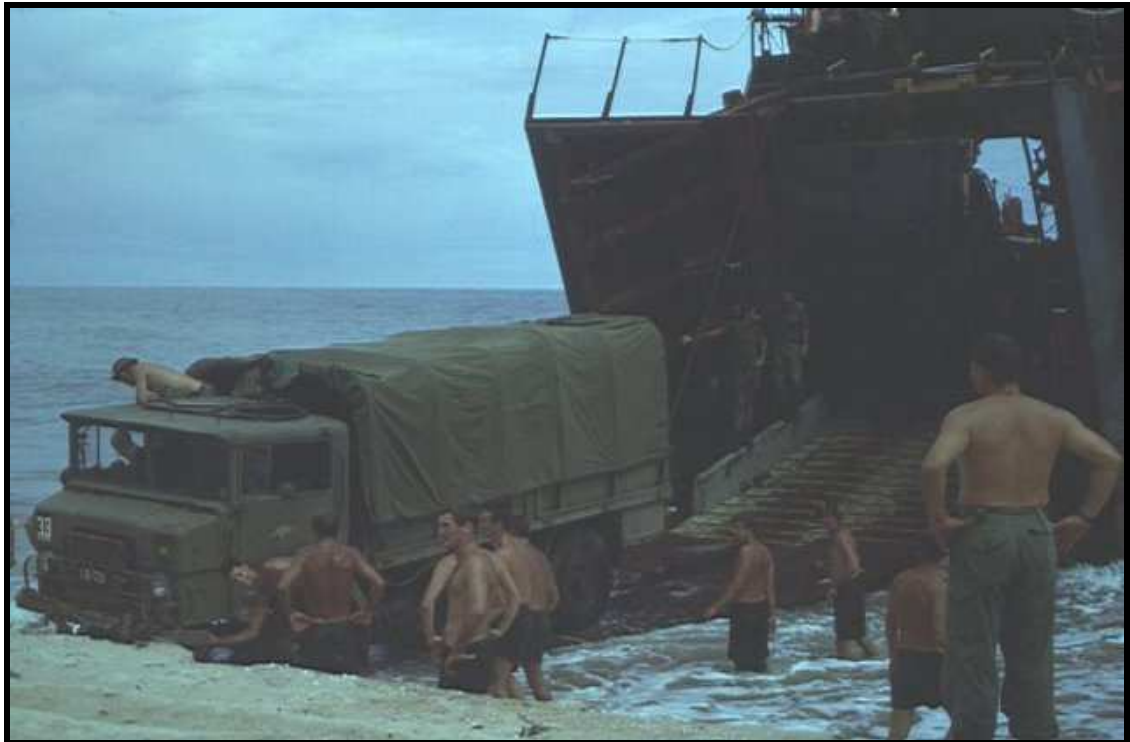
Photo 5-3.1 - LSM Harry Chauvel unloads vehicles, OP Kenmore (1967)