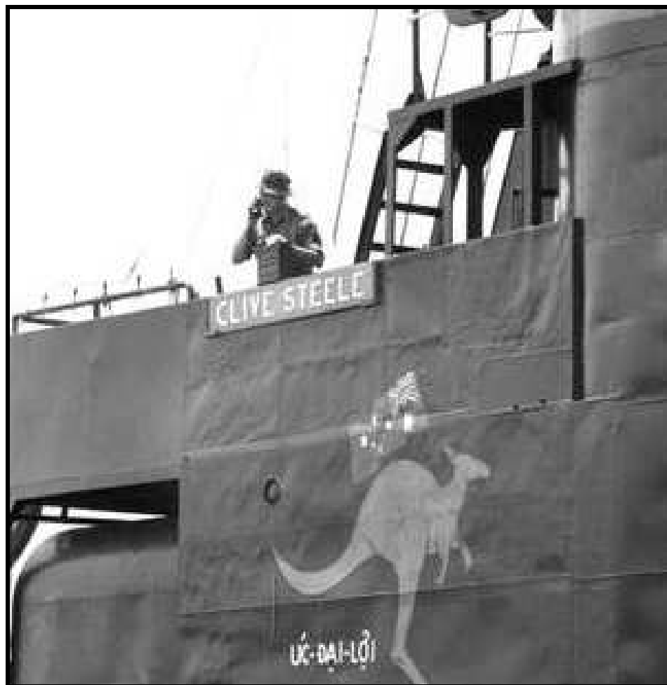
Photo 5-3.2 – Sgt Alva Knight (RASigs) using an AN/PRC-25 Radio Set to communicate with Army units from the AV Clive Steele in Vietnamese waters (1966)

Normally two or three Royal Australian Corp of Signals (RASigs) personnel were part of each ship's crew maintaining a radio watch 24 hours/7 days a week. Communication staff were responsible for transmitting and receiving by AM voice,