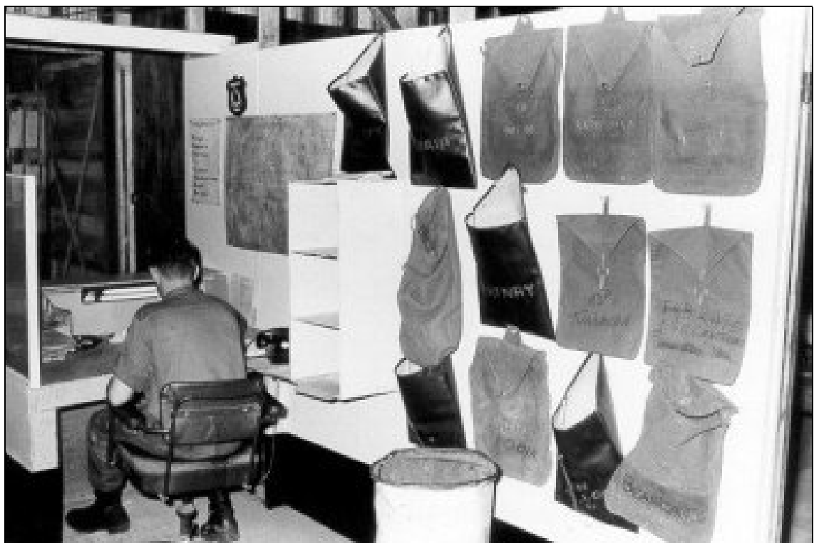
Photo 8.7 - COMMCEN Routing Clerk area 104 Signal Squadron - Note the ADS bags (1971)