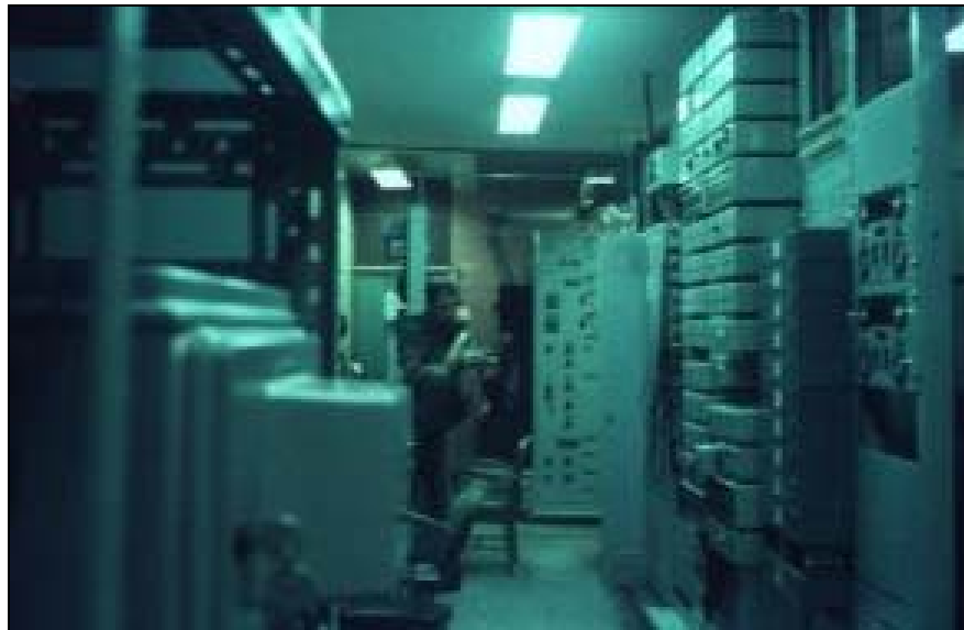
Photo 8.2 - Communication equipment at 110 Signal Squadron, Vung Tau (1970)

By early 1970 the Siemens Halske 24/400 equipment formed a triangulated commercial radio relay links from between Saigon to Nui Dat, Nui Dat to Vung Tau and Vung Tau via VC Hill back to Saigon. This freed the tactical radio relay AN/MRC-69 equipment for operations out of Nui Dat.