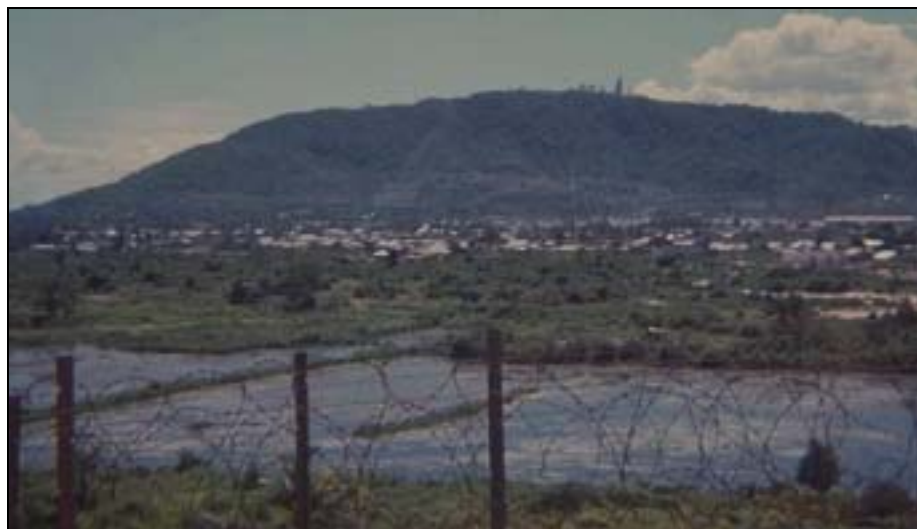
Photo 8.1 - VC Hill, Vung Tau (taken from 110 Signal Squadron lines) (1968)

The 252 members of 110 Signal Squadron were scattered in five fixed locations - Saigon, Long Binh, Vung Tau, VC Hill and Nui Dat; in addition there were often temporary deployments of AN/MRC-69 terminals to fire support bases or similar tactical locations.