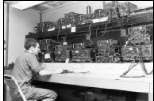
Photo 8.11 (left) - Inside the 104 Signal Squadron, Radio Bunker on Nui Dat Hill (Aug 1971)