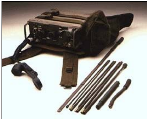
Photo 8.14 - AN/PRC-77 Radio Set with its two field Antennas

During 1968 and 1969 communications within and to the task force built up to the point where they were highly reliable, flexible and abundant. Quite possibly though RA Sigs has made a rod for its own back as any future conflict may not admit the same lavish scale of equipment nor may the area of operations allow such excellent communications - yet users will expect it. By early 1970 some of the VHF voice command radio nets, were upgraded to the AN/PRC-77 Radio Sets, so secure speech mode using the KY-38 could be used. This solved radio security concerns that had worried RA Sigs personnel since the first deployment to South Vietnam.