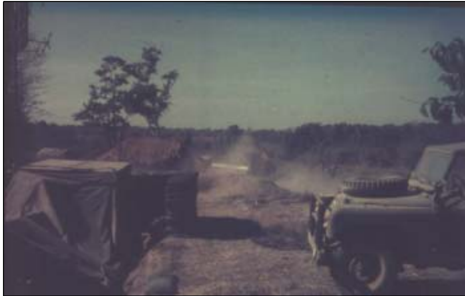
Photo 8.4 - Deployment Troop, 110 Signal Squadron setting up at FSPB Bond - AN/TRC-24 Antenna left side of photo with Shelter being dug in (1970)

Members of Deployment Troop were always a keen bunch ready to move with their AN/MRC-69 shelters to fire support bases and other field locations. A few members had a close shave at Horseshoe Hill near Nui Dat in early 1970 when a mortar bomb missed their shelter by a few feet, perforating it with extra ventilation holes.