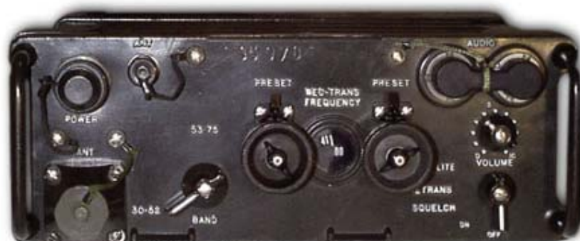
Photo 1.4 - AN/PRC-25 VHF Radio Set - Front panel layout