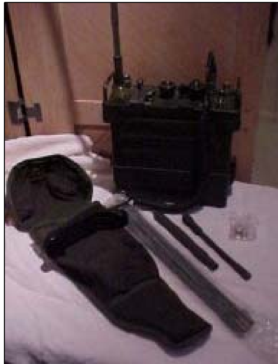
Photo 1.3 - AN/PRC-25 VHF Radio Set with two antennas and accessory bag

equipment. At this time the highly successful AN/PRC-25 VHF manpack radios and AN/VRC-12 series VHF vehicular radios were ordered. Also ordered were the ill fated AN/TRC-75 medium power HF radios.