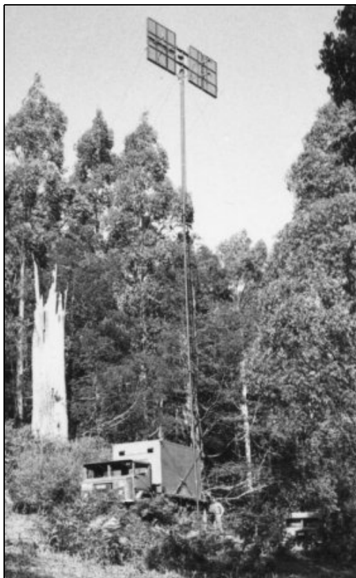
Photo 1.6 (left) - AN/MRC-69 Radio Relay Shelter on training exercise in Victoria

This equipment were received in time for our units to be predominately equipped with them by the time they were deployed in South Vietnam.