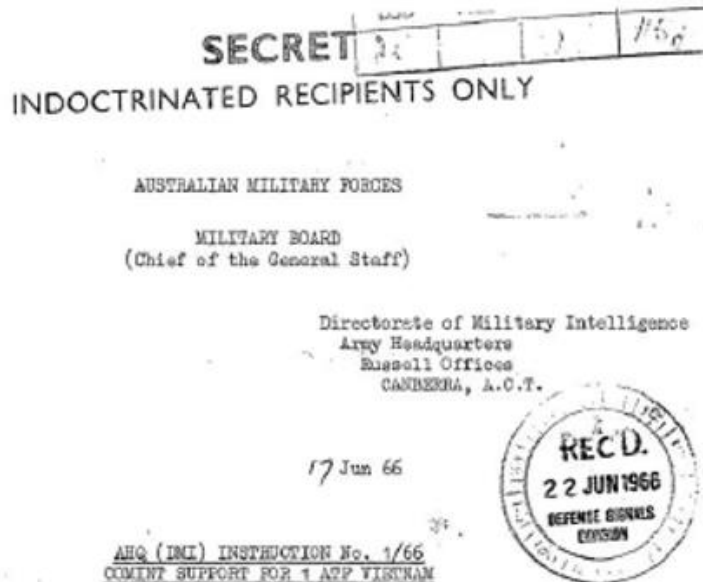
Figure 1: Comint Support Instruction

On 17 June 1966 1 , AHQ (DMI) Instruction No. 1/66 Comint Support For 1 ATF Vietnam 2 was issued by the then Director of Military Intelligence, Colonel "Sandy" Pearson 3 :